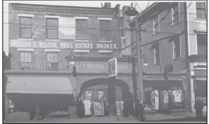
View of the Central Theater, West Broad St., Pawcatuck, Conn.

The Central Theater on West Broad Street and the present United Theater on Canal Street rounded out Westerly's theatrical construction, still in use these structures came after the hey-day of the illustrated songs that are our special interest this evening.