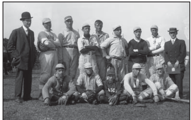
THE WAKEFIELD TEAM is always ready to join the Rhode Island – Connecticut League. Is the suited at the right holding a contract in his brief case? A 1908 era photo.

Saturday's games provided the league with an additional problem, when Westerly defeated Stonington, 3-2, in ten innings. That tied both teams at 15 Won, 6 Lost P.C. .714