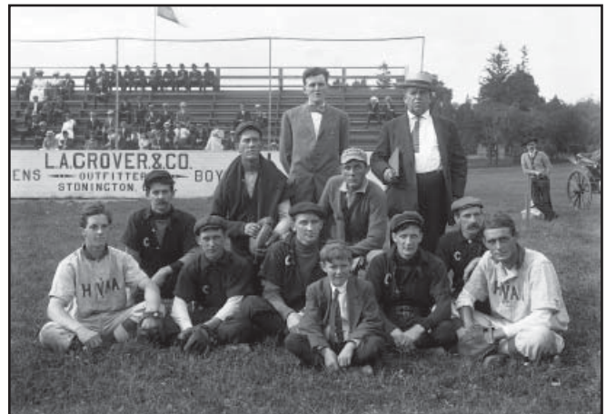
SOME HOPE VALLEY TEAM members appear to be mixed in with another team in this 1908 era snapshot. The shot was taken at the Stanton Field in Stonington.